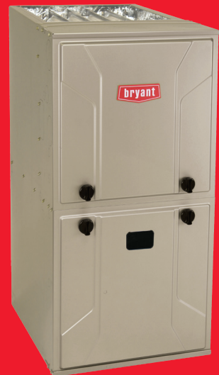
Models 912S, 916S